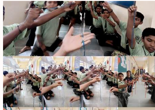
Rakhee making workshop conducted by the club for the students of RR School, Mhada.