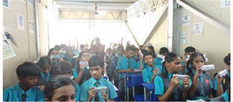
Distribution of spectacles for the students of Vidyadeep Vidhyalaya.