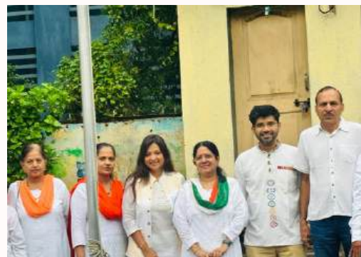
Independence Day celebration at the Rotary Centre, Mulund.